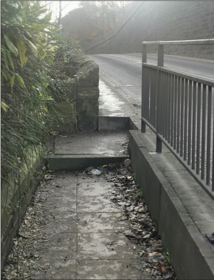
Figure 2: Inaccessible surface conditions.

If people are prevented from walking or cycling in these, or similar ways, then what are the justice implications? One option that people have in this case is to forego whatever activities the walking or cycling enabled. Alternatively, if they have the option, they tend to make the journey by public transport. This assumes, however, that public transport is both available and accessible, and either or both might not apply. Or, if they are able, people can make the journey by car or van. However, this last option pulls against efforts to reduce motor traffic and at best impedes the justice requirement to reduce harm of traffic. Yet, suggesting the activity is foregone could also be an injustice. Whether or not it is foregone, could be a complex question in some cases, but not in others. It would be difficult to maintain there is justice if people are excluded from everyday activities such as accessing basic services, education, employment or (pandemics notwithstanding) being with family and friends. If barriers to walking and cycling mean these activities can only be undertaken by using a vehicle, then justice might actually require that access to vehicles is facilitated. In this way, this situation creates a tension for mobility justice.