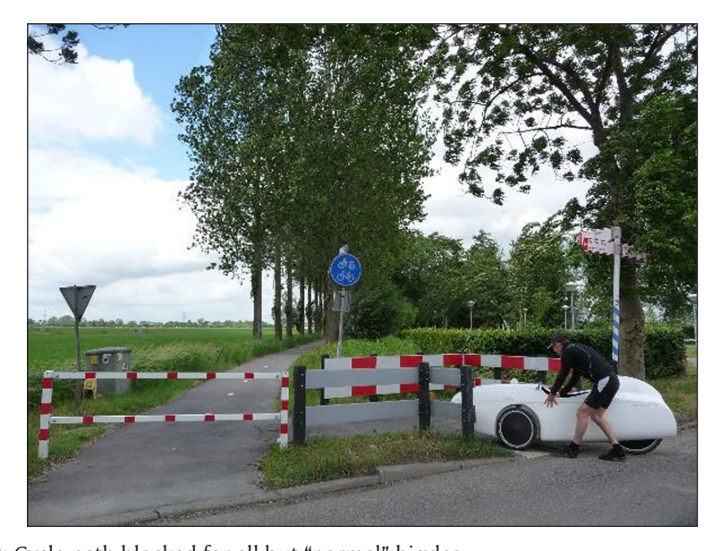
Figure 3: Cycle path blocked for all but "normal" bicyles.

The longer the distance, the more an assessment of accessibility, convenience, and comfort, or the lack thereof, develops. We have the example of awkwardly placed road signs (right in front of a wall, so we are forced to stop and turn our heads) or road signs with no follow-up (usually the case with roadwork diversions) or absent altogether. We have tracks, apparently the "old road", gradually turning into muddy and bumpy paths, the maintenance obviously neglected since the motor highway was built. We have junctions that always mean slowing down and taking a detour; solutions for the through traffic of cyclists are always dependent on/delineated by the through traffic for cars. We have bypasses with no signs, but sometimes