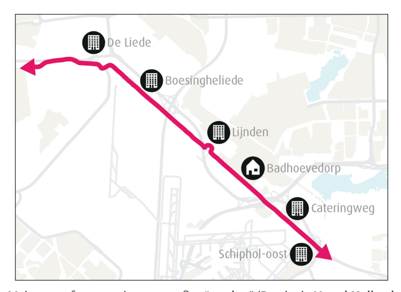
Figure 4: Main part of commuting route—five "patches" (Provincie Noord-Holland, 2019).

Before and after the N232 track, I cycle, respectively, a modern part of the city of Haarlem and, as previously stated, a woody park-like patch in Amsterdam that entails a rowing track, along which the cycle path is shared with pedestrians and slow cycles used by trainers and coaches of the rowing teams. This track is also quite inviting in terms of negating the "No cyclists" sign that suddenly appeared in 2015 (see further below for "negating"). For me, it