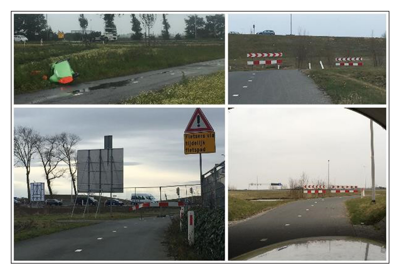
Figure 5: Collage of detrimental situation 2019–2021.