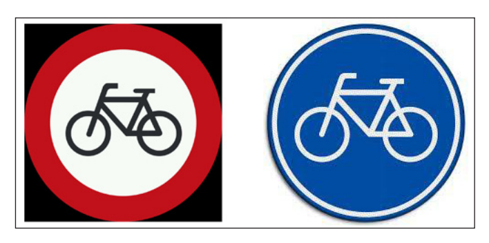
Figure 2: Micromanagement via signing.

In Germany, cycle paths were quite abundant but often shared pedestrian spaces; thus, we drove between cars that did not always accept us and whose drivers demonstrated that by whooping and sometimes shouting out their windows. But, overall, there was even more curiosity about our cycles than in our home country. A man saw us coming at a crossroads,