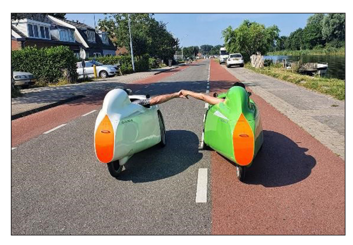
Figure 7: Velomobiles on the road.

a different meaning. What if we reverse priority, or power for that matter, for AM?<sup>18</sup> What if we take a closer look at how in our discourse slow and fast determine our attitudes towards AM and PM, how for AM long-distance is measured in a different time frame, if only in terms of the element of being human powered and not petroleum driven? What if we came to realize that, as the cycle path experience demonstrates, long-distance cycling has the potential to avoid traffic jams, provide an alternative for bad public transport connections, and save city space for parking? Maybe then it is not "Cyclists dismount" but "Car drivers look for an alternative".<sup>19</sup>