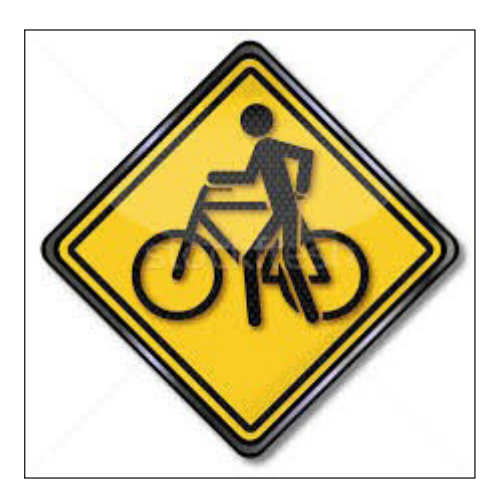
Figure 1: Cyclists dismount.